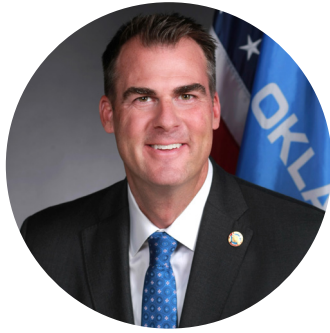
The Honorable J. Kevin Stitt Governor of Oklahoma